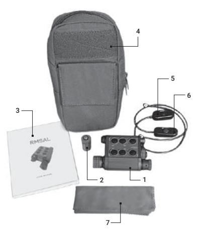
FIGURE 1-2. STANDARD COMPONENTS

RMSAL standard components are shown in Figure 1-2 and listed in Table 1-2. The ITEM NO. column indicates the number used to identify items in Figure 1-2.